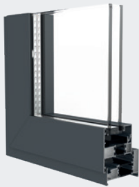
WINDOW SASH CORNER