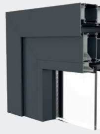
DOOR SASH CORNER